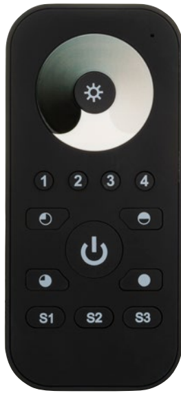
Single Coloured Zigbee LED Remote Control HV9102-ZB-SCREM