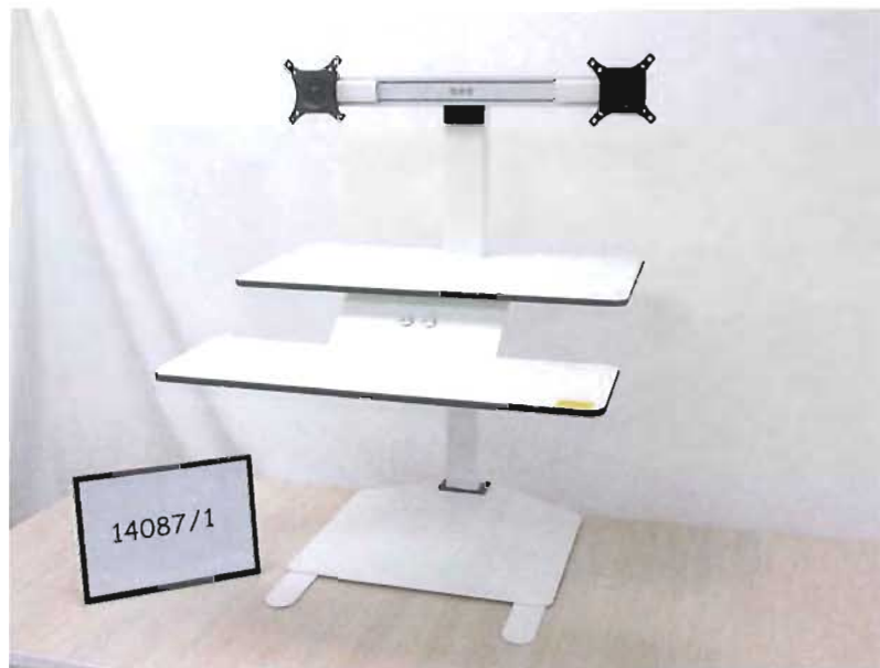
Standesk OP-MB-700W + Keyboard White - with twin monitor arm - as tested

Furntech-AFRDI No: 14087/1 Supplier: Office Portfolio Supplier Address: 34a Gray Street Tranmere S.A. 5073 Product Described As: Standesk - OP-MB-700W + Keyboard White Date of Test: 8 March 2018