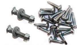
K) 5/16" x 2" CARRIAGE BOLT, NUT & WASHER -2 & SELF TAPPING SCREWS -16