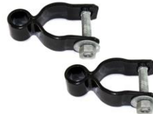
I) FEMALE HINGES -2