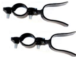
G) GATE LATCHES -2