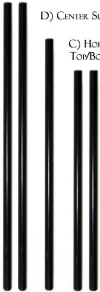
C) HORIZONTAL TOP/BOTTOM -2