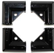
E) CORNER BRACES -4