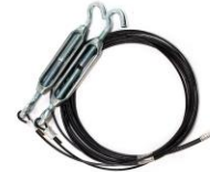
L) CORNER TENSION WIRE - 2