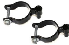
H) MALE HINGES -2