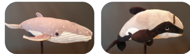
Māui Dolphin and Bryde's Whale soft toys also available from Tile Depot stores

Explore our array of merchandise and support WWF. Visit shop.whaletales2022.org