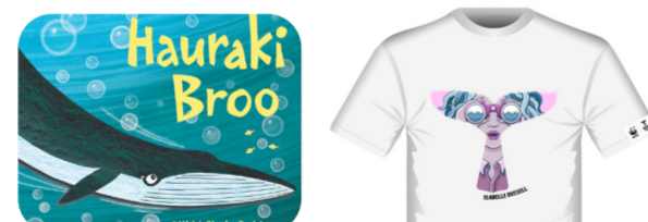
Hauraki Broo children's book