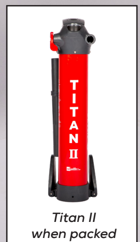
Titan II when packed