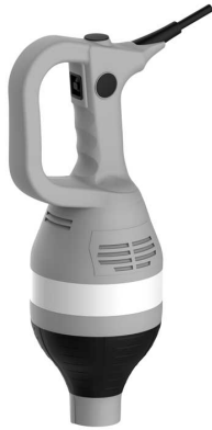
Sirman Hand Held Mixer , model Vortex 75. :

Sirman Spa Viale dell'Industria 9/11 35010 PIEVE DI CURTAROLO (PD), Italy Tel./Fax. +39 049 9698666 / +39 049 9698688 email: info@sirman.com