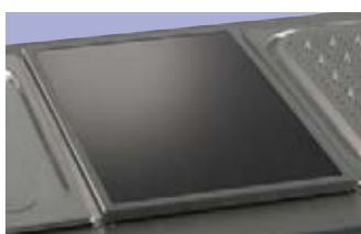
Glass insert - DHCPI