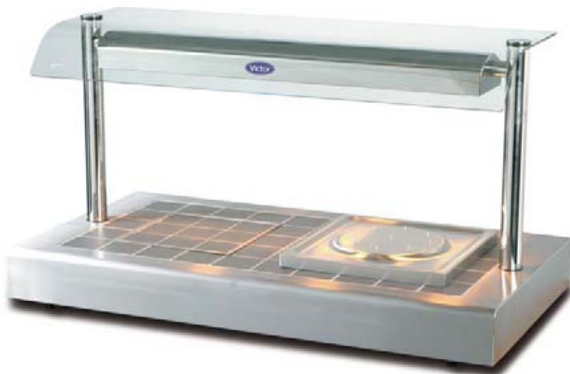
Carvery topper with curved glass gantry and slate grey tiles