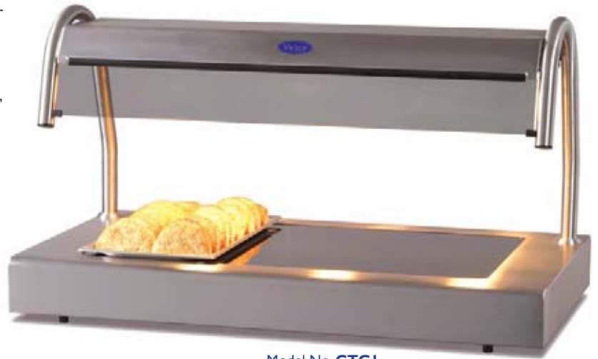
Model No. CTG1 1200 x 650 x 635mm 1.9kW