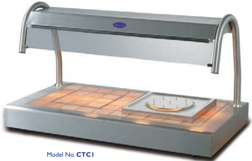
Model No. CTC1 1200 x 650 x 635mm 2.4kW