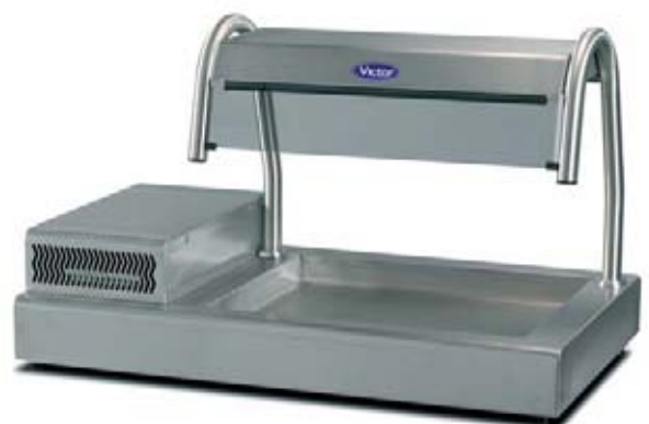
Model No. CTREF11 1100 x 650 x 635mm 1.0kW