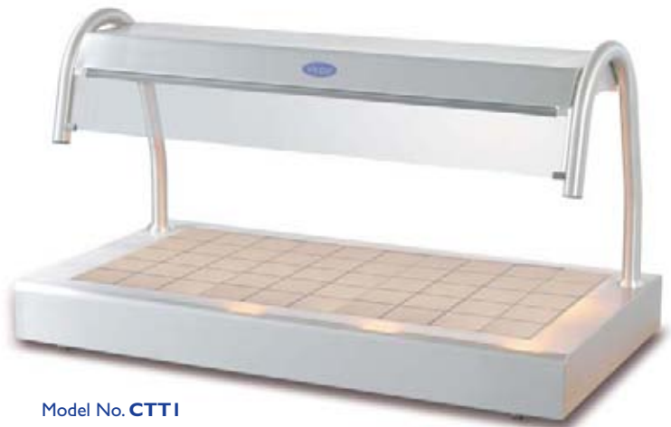
Model No. CTT1 1200 x 650 x 635mm 2.4kW

Tile colours may differ from those illustrated.