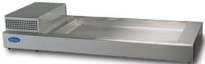
Model No. BTOREF3 1500 x 650 x 260mm 1.0kW