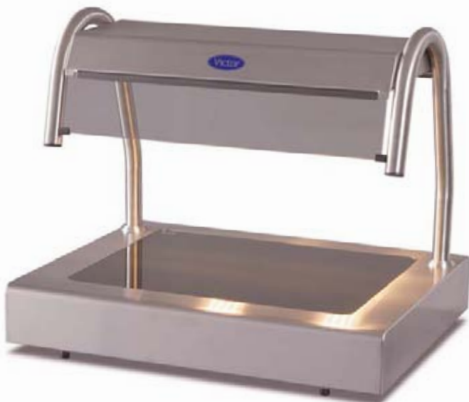
Model No. CTG2 800 x 650 x 635mm 1.1kW