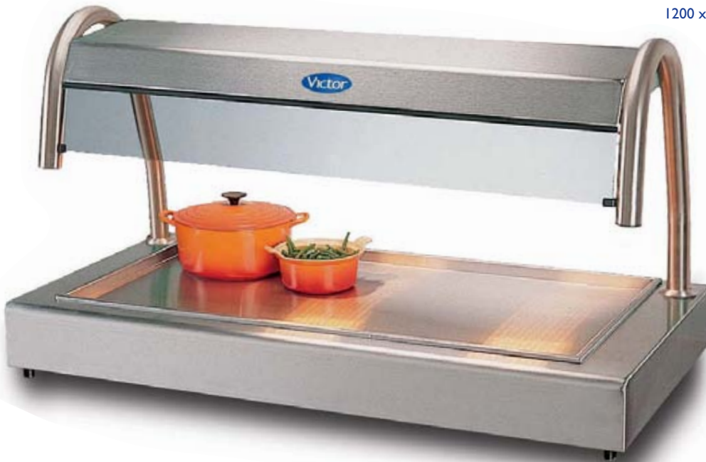
Model No. CTP1 1200 x 650 x 635mm 2.4kW