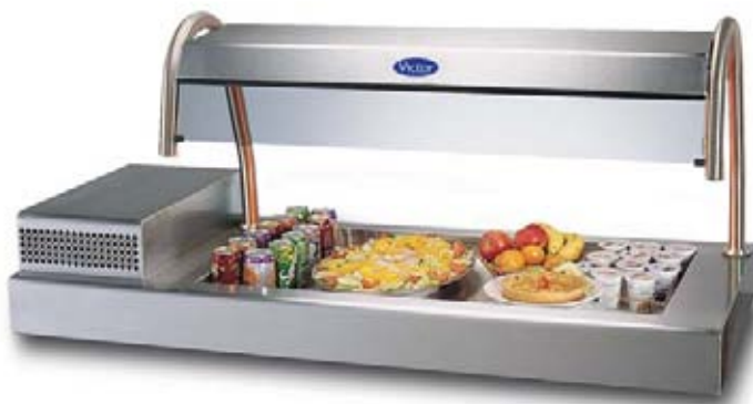
Model No. CTREF15 1500 x 650 x 635mm 1.0kW