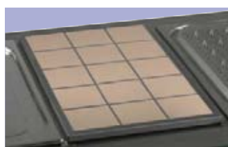
Tiled insert - DHTPI