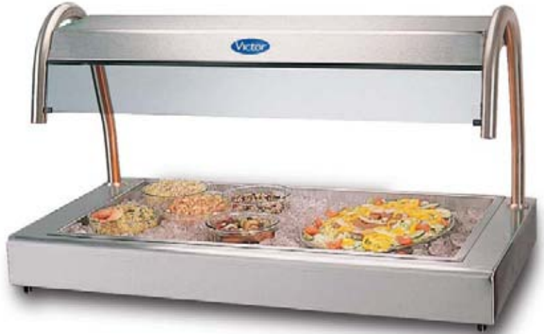
Model No. CTSI 1200 x 650 x 635mm 0.2kW