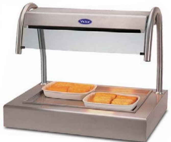
Model No. CTP2 800 x 650 x 635mm 1.35kW