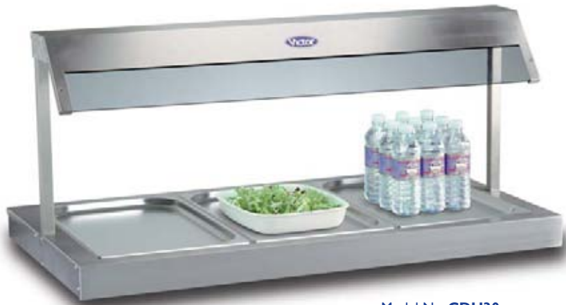
Model No. CDU30 1110 x 580 x 520mm 21W

Gastronorm containers are optional extras.