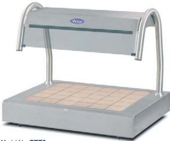
Model No. CTT2 800 x 650 x 635mm 1.35kW