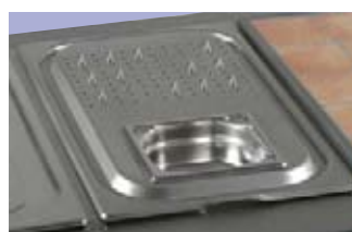
Carvery/Gravy insert - BMCVI