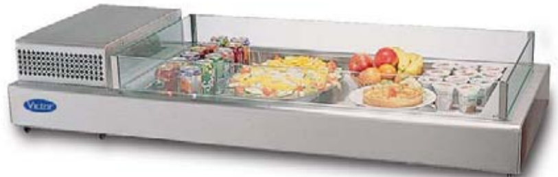
Model No. BTOREF1 1500 x 650 x 260mm 1.0kW