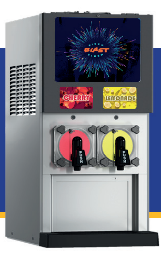
Available in stainless steel

High output , dual flavour carbonated frozen slush machine.