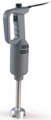
Sirman Hand Held Mixer , model Storm :

Sirman Spa Viale dell'Industria 9/11 35010 PIEVE DI CURTAROLO (PD), Italy Tel./Fax. +39 049 9698666 / +39 049 9698688 email: info@sirman.com