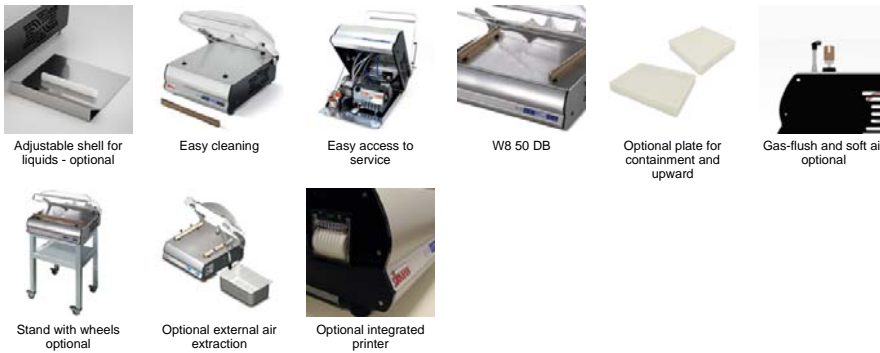
Adjustable shell for liquids - optional

Legend of models: DX = DVP suction pump / stainless steel holding surface BX = Bush suction pump / stainless steel holding surface DB = Double sealing bar