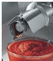
Optional tomate sauce making