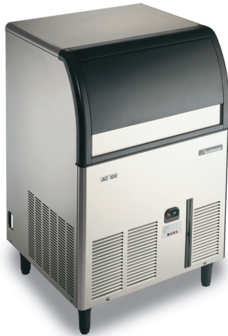
Spray bar quick disconnect