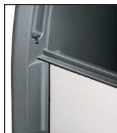
Proximity condenser air filter