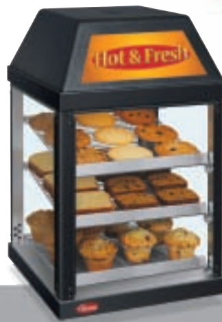
Model MDW-1X In Designer black with optional hood with backlit sign cutout on one side (graphic included)

Printed colors are a representation and may not exactly match our Designer colors.