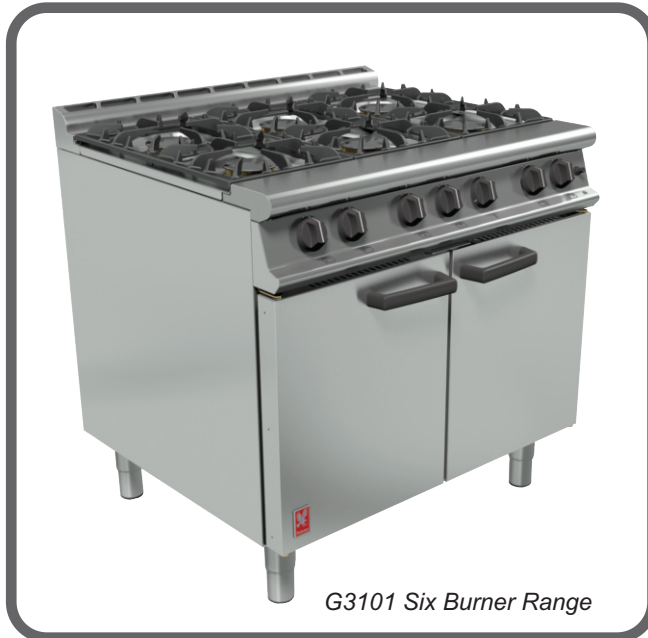
G3101 Six Burner Range