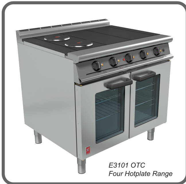
E3101 OTC Four Hotplate Range