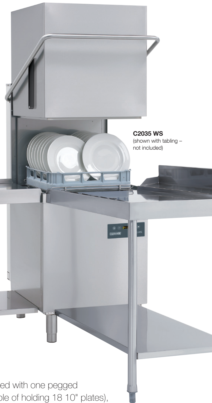
C2035 WS (shown with tabling – not included)

Supplied with one pegged (capable of holding 18 10" plates), one open rack (capable of holding 25 pint glasses) and cutlery insert.