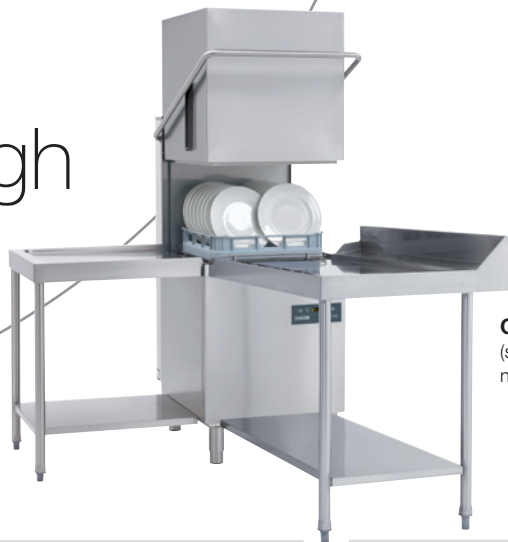
C2035 WS (shown with tabling – not included)