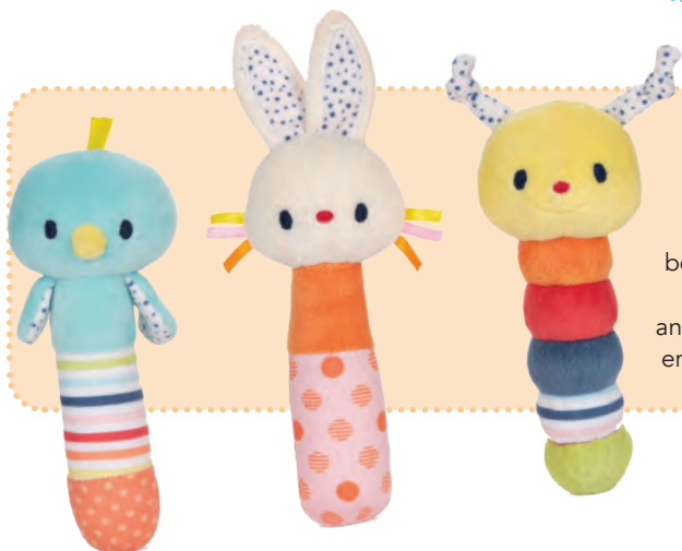
Tinkle Crinkle rattles

GUND has introduced the Tinkle Crinkle Collection for babies. The plush assortment includes lovies, activity toys, rattles, plush animals, and balls with bright fabrics and embroidered details. The collection features a variety of characters, including bears, hedgehogs, and caterpillars.