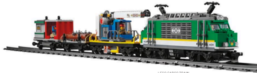
LEGO CARGO TRAIN