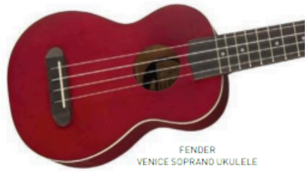
FENDER VENICE SOPRANO UKULELE