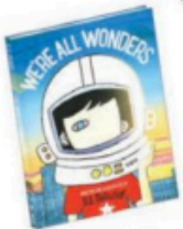
"WE'RE ALL WONDERS" BY R.J. PALACIO