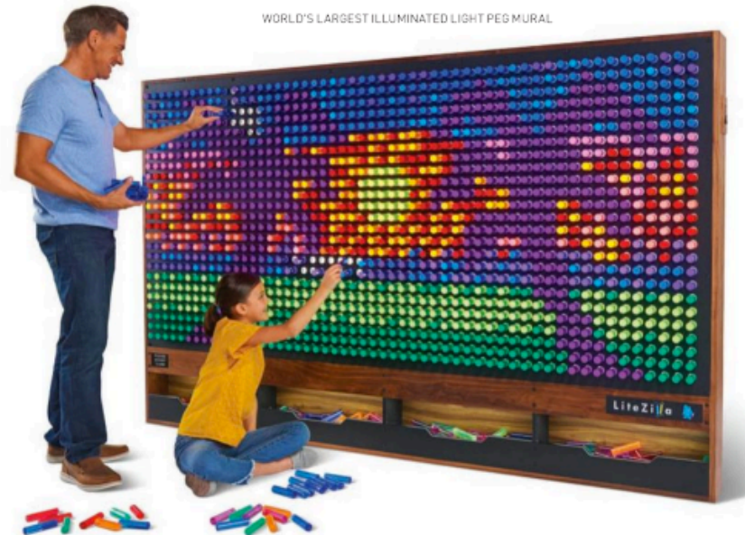
WORLD'S LARGEST ILLUMINATED LIGHT PEG MURAL