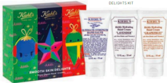
KIEHL'S SMOOTH SKIN DELIGHTS KIT