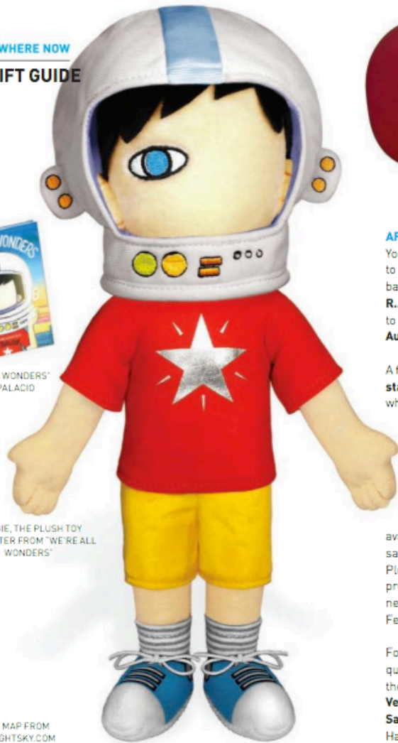
AUGGIE, THE PLUSH TOY CHARACTER FROM "WE'RE ALL WONDERS"