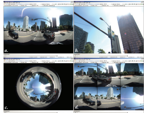
a. Panoramic view b. Spherical view c. Dome view d. Multi-camera view