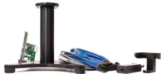
Hardware Development Kit

USB 3.1 Gen 1 interface makes 12-bit RAW imaging possible.