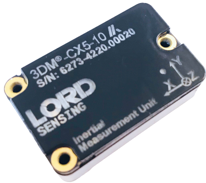
3DM-CX5-10- high-performance, industrial-grade inertial measurement unit (IMU)

The LORD Sensing 3DM-CX5 family of high-performance, industrial-grade, board-level inertial sensors provides a wide range of triaxial inertial measurements and computed attitude and navigation solutions.