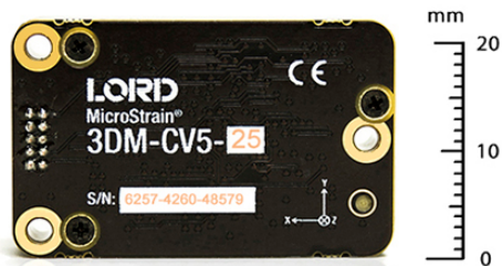
3DM-CV5-25-miniature, industrial-grade attitude and heading reference system (AHRS) with integrated magnetometers, high noise immunity, and exceptional performance

The LORD Sensing 3DM-CV5 family of industrial-grade, board-level inertial sensors provides a wide range of triaxial inertial measurements and computed attitude and navigation solutions.