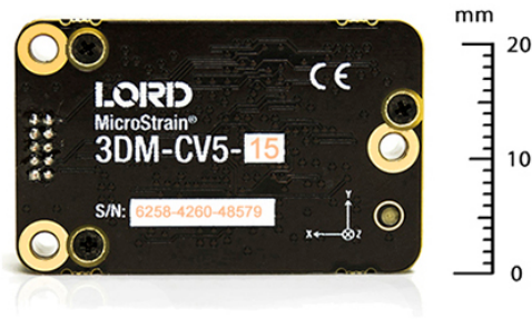
3DM-CV5-15- miniature, industrial-grade inertial measurement unit (IMU) and vertical reference unit (VRU)

The LORD Sensing 3DM-CV5 family of industrial-grade, board-level inertial sensors provides a wide range of triaxial inertial measurements and computed attitude and navigation solutions.