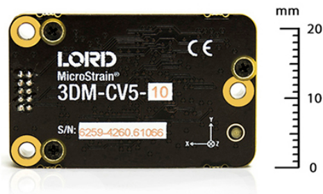
3DM-CV5-10- miniature, industrial-grade inertial measurement unit (IMU)

The LORD Sensing 3DM-CV5 family of industrial-grade, board-level inertial sensors provides a wide range of triaxial inertial measurements and computed attitude and navigation solutions.