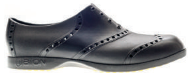
BLACK | BCL - 1001

The natural characteristics of EVA make it great for footwear because it molds to your foot, whether you choose to wear socks or not! It's also incredibly shock absorbent, machine-washable, odor-resistant, and anti-micro-bacterial.