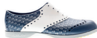
ANCHOR | BOP - 1035