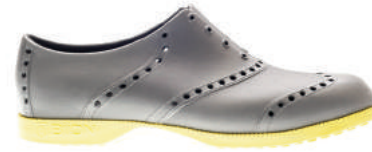
GRAY & NEON GREEN | BOB - 1015