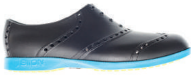
BLACK & NEON BLUE | BOB - 1123