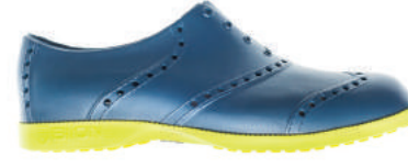
NAVY & GREEN YELLOW | BOB - 1125