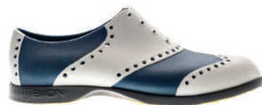
SILVER & NAVY | BOW - 1021

Why the hexagon shape? Just ask any engineer... or honeybee. A hexagonal cell can support 25 times its own weight, which is why it's the building block commonly used in the construction of airplane wings and, of course, honeycombs