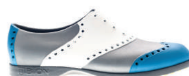
BLUE, WHITE & SILVER | BOW - 1030