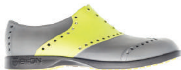
COOL GRAY & LIME | BS - 1113