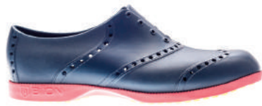
NAVY & RED | BOB - 1016