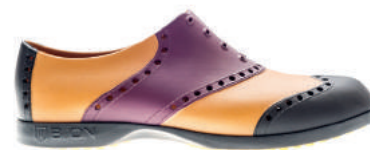
CRIMSON RED, BLACK & LEATHER | BOW - 1028