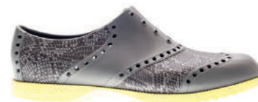
SNAKE | BOP - 1034