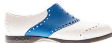
WHITE & BLUE | BS - 1012