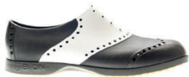
BLACK & WHITE | BS - 1007