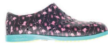
FLAMINGO | BOP - 1139