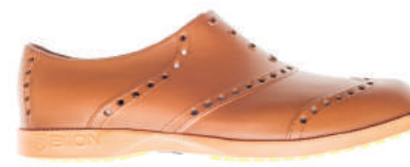
BROWN & BRIGHT ORANGE | BOB - 1122