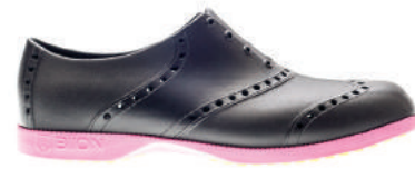
BLACK & MAGENTA | BOB - 1014