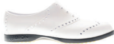
WHITE | BCL - 1002