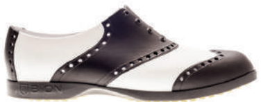
WHITE & BLACK | BCL - 1004