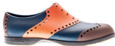
ORANGE, BROWN & NAVY | BOW - 1027