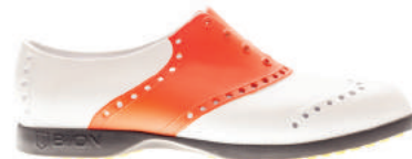
WHITE & ORANGE | BS - 1010