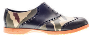
CAMO | BOP - 1031