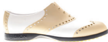
WHITE & TAN | BCL - 1006