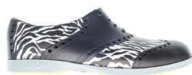
ZEBRA | BOP - 1141