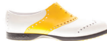
WHITE & YELLOW | BS - 1011