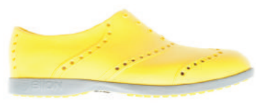
MUSTARD & GRAY | BOB - 1124