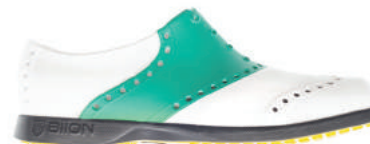
WHITE & MINT | BS - 1114