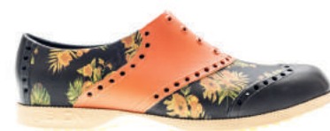
LUAU | BOP - 1033