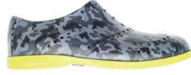
BLACK CAMO | BOP - 1142