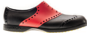
BLACK & CHERRY | BS - 1009