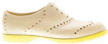
KHAKI & NEON GREEN | BOB - 1020