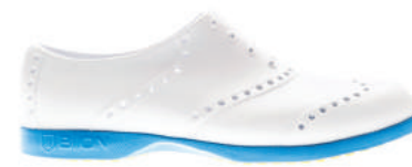
WHITE & BLUE | BOB - 1019