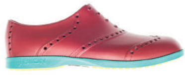
BRICK RED & TEAL | BOB - 1121