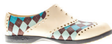
ARGYLE | BOP - 1032