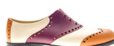
CRIMSON RED, SAND & LEATHER | BOW - 1029