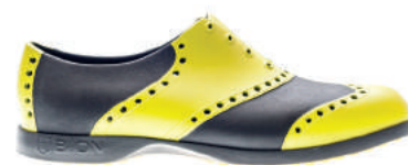
GREEN & BLACK | BOW - 1023