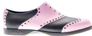
BLACK & PINK | BCL - 1005