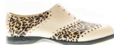
LEOPARD | BOP - 1036