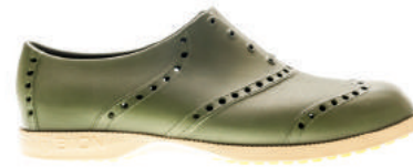
GREEN & KHAKI | BOB - 1017