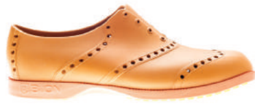
LEATHER & ORANGE | BOB - 1013