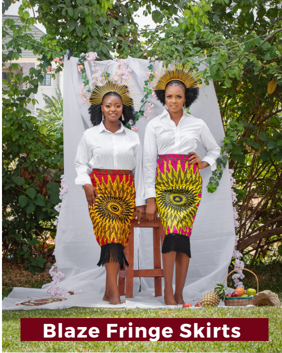
Blaze Fringe Skirts