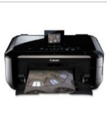
The printer I currently use: Canon MG6220 Photo Printer

Shiny Designs collage sheets are designed to print on standard size 8 1/2 x 11 inch paper at 300 dpi. Set your printer settings to print exact size and set print quality at the highest setting. Some printers (and software) scale the images to fit the page so check for that as well.