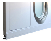
Baseboard On (not supplied)