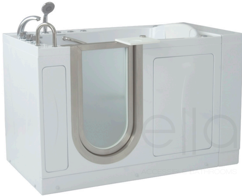
93117 Left Hand Door and Drain