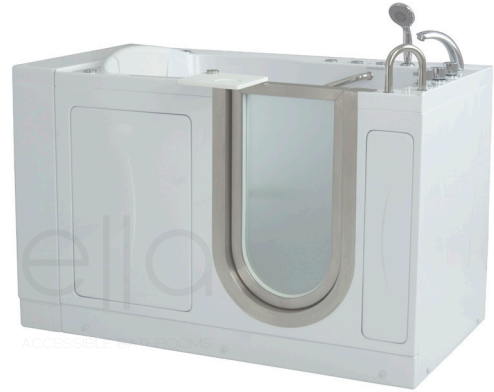
93118 Right Hand Door and Drain

Actual Size: 31.75" W x 52.25" L x 38" H Shipping Size: 36" W x 57" L x 46" H Shipping Weight: 320 lbs. Net Weight: 220 lbs. Water Capacity: 90 gal. US (unoccupied) 55-75 gal. US (occupied)