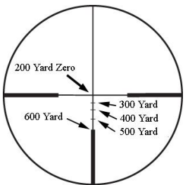
Scout Rifle .308 BDC Reticle

We have developed a LER27X32BDC scout rifle scope for the .308 caliber.