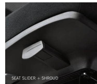
SEAT SLIDER + SHROUD