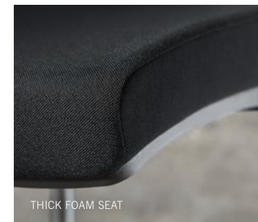
THICK FOAM SEAT