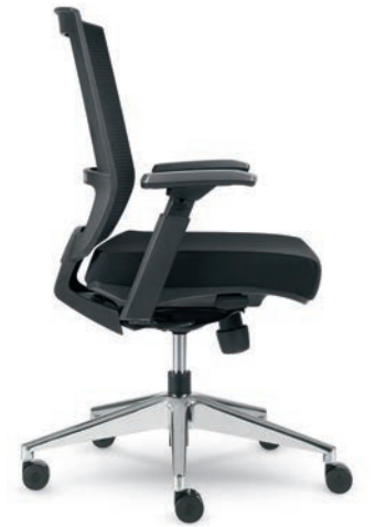
ENTAIL WITH BLACK FRAME AND ALUMINUM BASE. MESH BACK IN JET BLACK, SEAT UPHOLSTERED WITH GABRIEL ATLANTIC IN MELANITE.