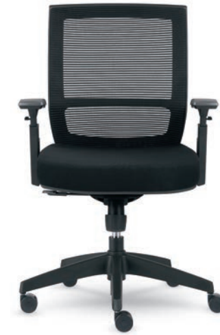
ENTAIL WITH BLACK FRAME FINISH. MESH BACK IN JET BLACK, SEAT UPHOLSTERED WITH GABRIEL ATLANTIC IN MELANITE.