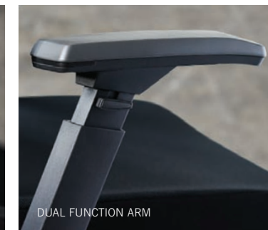
DUAL FUNCTION ARM