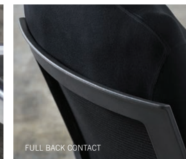
FULL BACK CONTACT