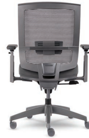
ENTAIL WITH ADJUSTABLE LUMBAR AND SMOKE FRAME FINISH. MESH BACK IN CARBON, SEAT UPHOLSTERED WITH GABRIEL ATLANTIC IN QUARTZ.

Entail is available in a smoke or black frame finish and its back mesh is available in a range of 14 colors. The mesh is integrated into the back frame to prevent fraying and extend its lifespan. An optional padded lumbar and headrest are available to provide added support.