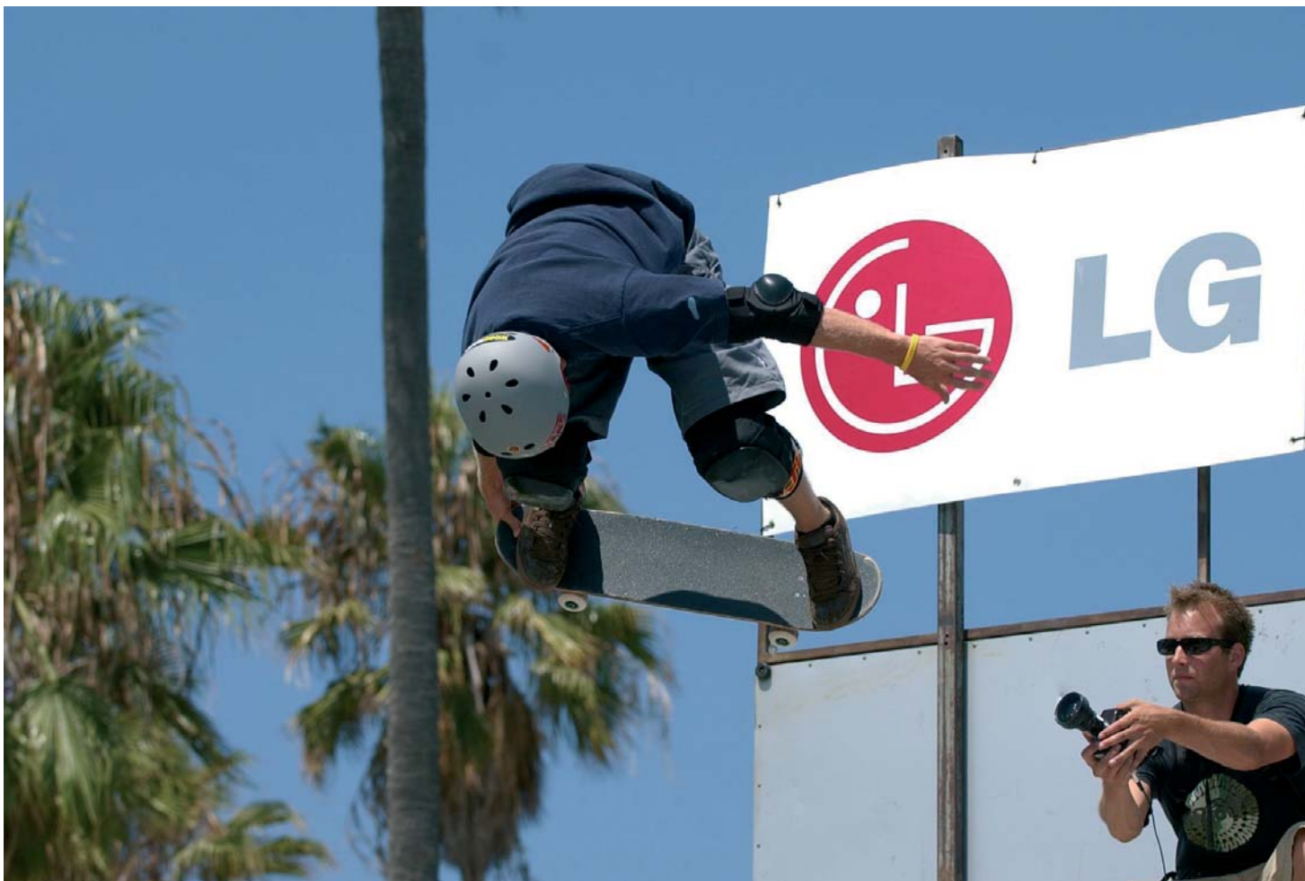
A skateboard event, filmed for LG with a Pro8mm Classic Beaulieu camera.

„I chose the format because it allowed me to create an image and feel that is strikingly different from video and 16/35 mm film.“