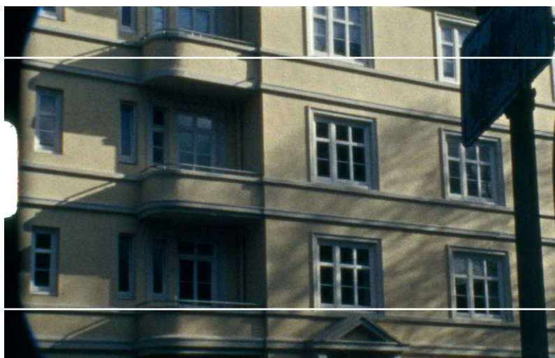
The lines indicate where the image will be scanned to create 16:9 images. The vignetting on the top and bottom left are a typical problem with Schneider optics at certain focal lengths and distance settings – this is something that Pro8mm was unable to change.

awakens high expectations on account of its price. Those who see the images that this film equipment delivers will not be disappointed. It squeezes everything technically feasible out of the Super 8 format. The disguised Beaulieu could be a little more comfortable to handle, but professional equipment is usually a bit awkward in this sense. Whether the 16:9 modifications really makes sense – particularly since part of the image frame (and therefore resolution) must be sacrificed – is somewhat doubtful. Super 8 is essentially a 4:3