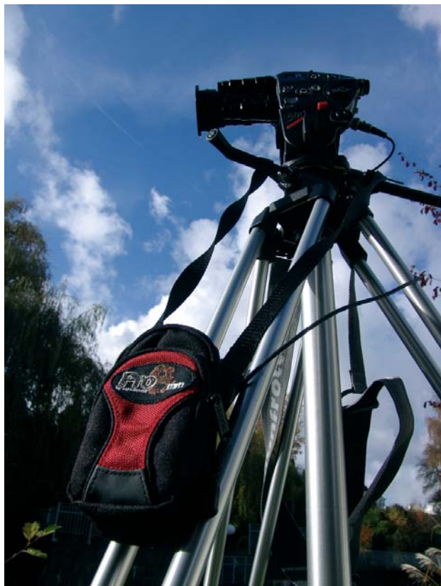
Necessary attachment: The battery pack must always be connected to the camera by a cable.

Unfortunately, the case provided with the camera requires you to remove the lens to fit into the provided cutouts.