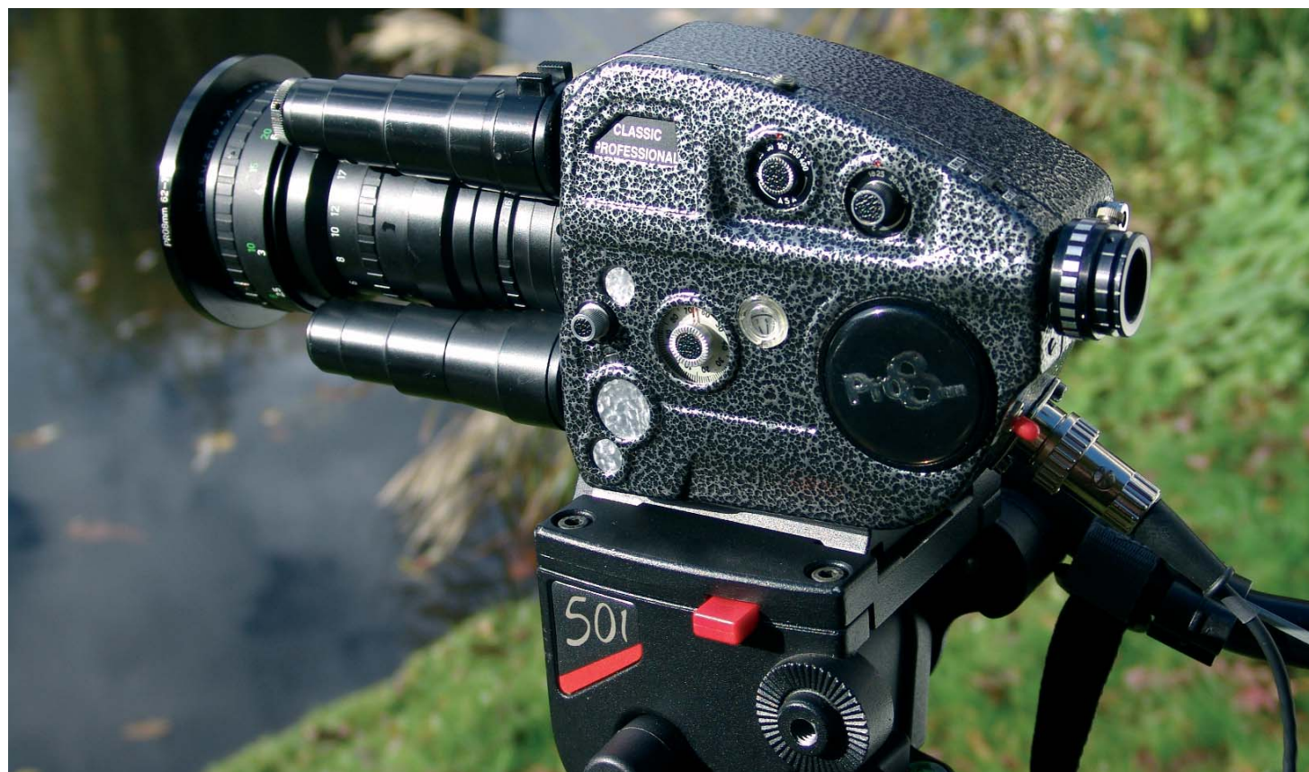
The Pro8mm Classic professional camera in operation.

It is an inspiring feeling to hold a new cine camera in one's hands. Admittedly, the item in question is not quite new, but it looks that way – “remanufactured” is the correct technical term for these Beaulieu 4008s, which contain refurbished parts and new components. The Pro8mm Classic Professional Camera – with Max 8 format 16:9 widescreen modification and quartz-controlled “Crystal Sync” speed regulation – spent a week on the test bench in our editorial office.