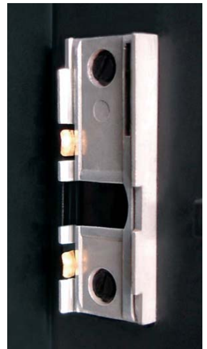
Note the left of the image frame: The enlarged Max 8 film gate for the 16:9 format.

The silver and black speckled Pro8mm Classic Professional is a camera that