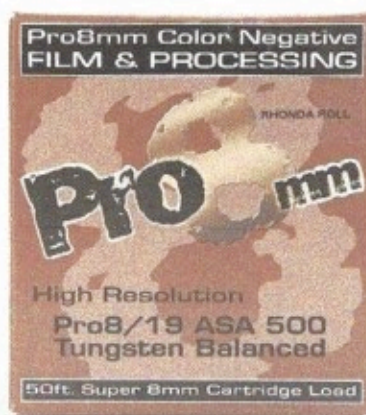
Rhonda Roll on Urban Outfitters

Additional Releases about the Rhonda CAM: