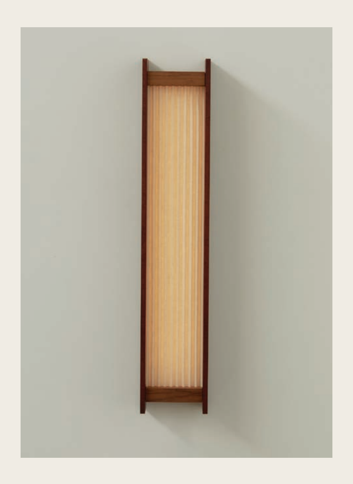
LINEAR — W02 160w x 840h x 120d Edition of 20 $1,800