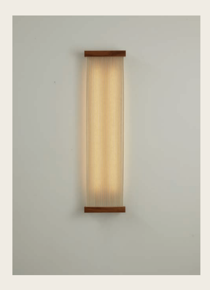
LINEAR — C03 SINGLE