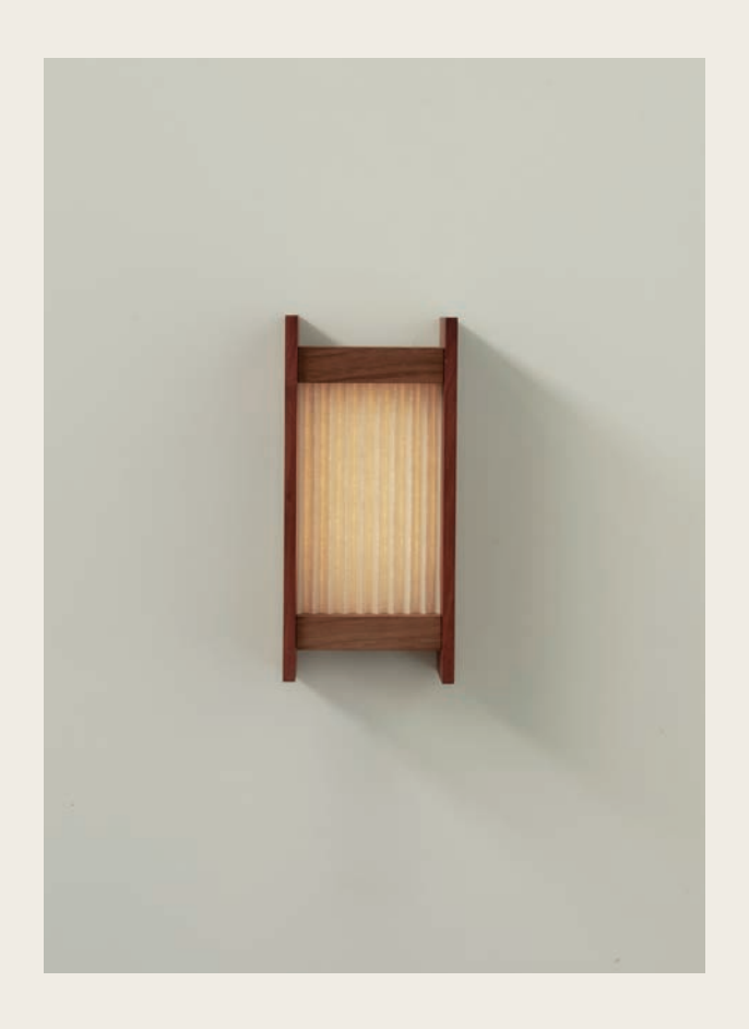
160w x 340h x 120d Edition of 20 $1,500