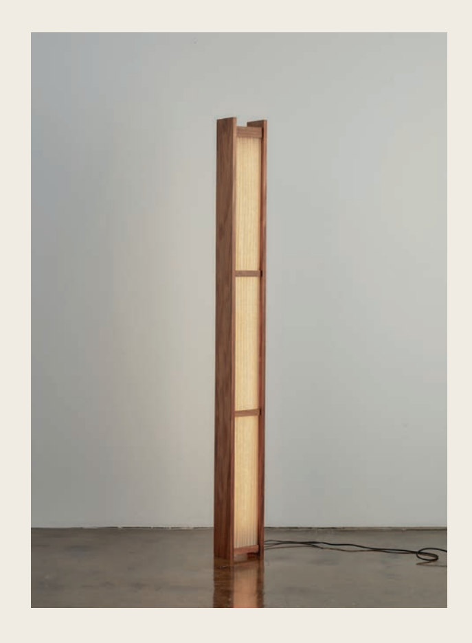
LINEAR — W03 170w x 1810h x 120d Edition of 1 (wall light) $2,800