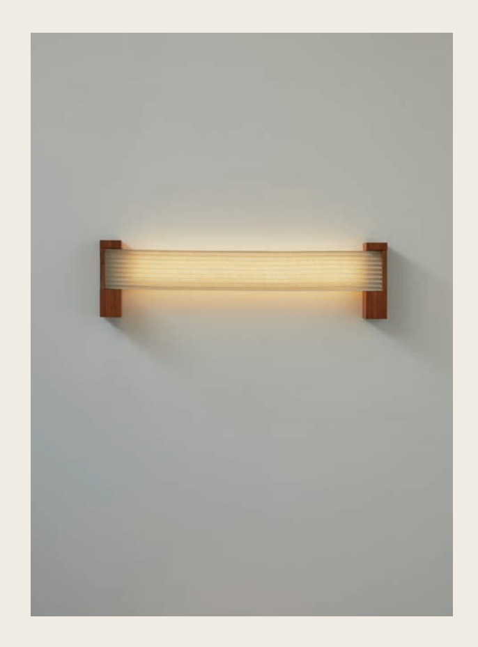
LINEAR — C02