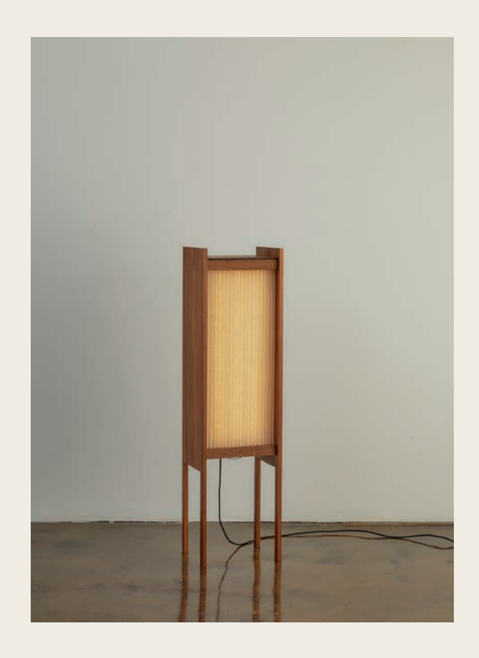
LINEAR — F01 320w x 1200h x 255d