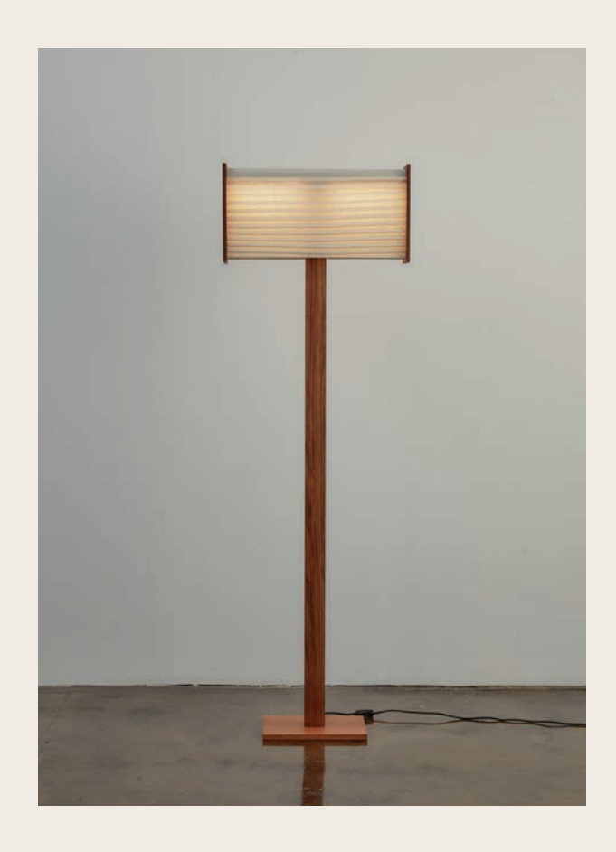
LINEAR — T02