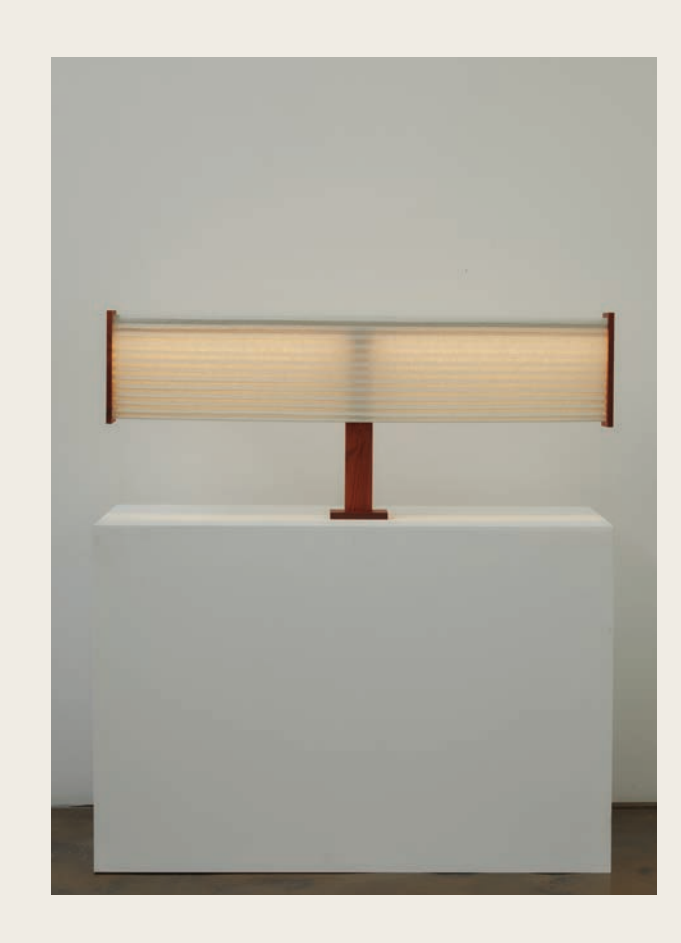
LINEAR — T03