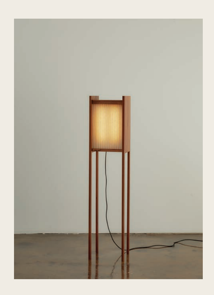
LINEAR — F03