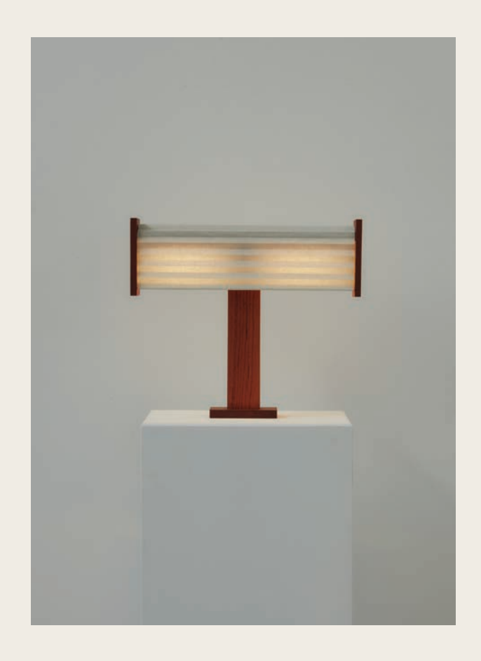
LINEAR — T01