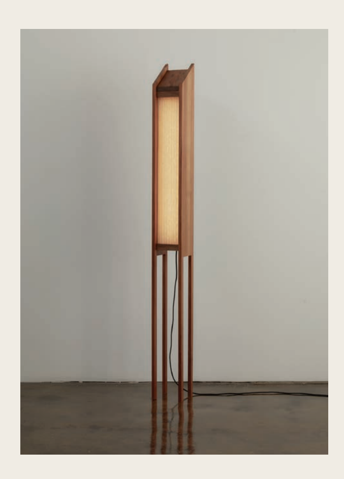
LINEAR — F02