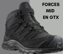
XA FORCES MID EN GTX