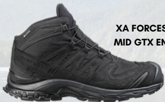
XA FORCES MID GTX EN