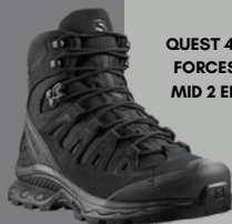
QUEST 4D FORCES MID 2 EN