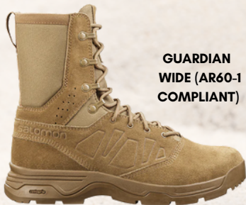
GUARDIAN WIDE (AR60-1 COMPLIANT)