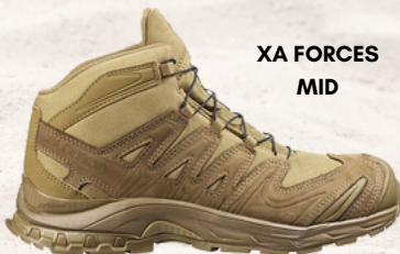
XA FORCES MID