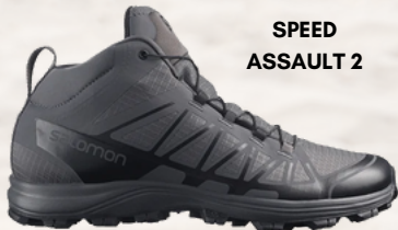
SPEED ASSAULT 2