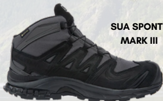
SUA SPONTE MARK III