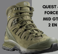
QUEST 4D FORCES MID GTX 2 EN