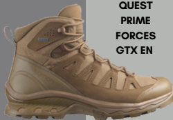
QUEST PRIME FORCES GTX EN