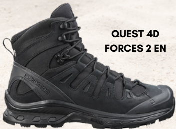
QUEST 4D FORCES 2 EN