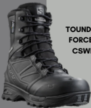
TOUNDRA FORCES CSWP