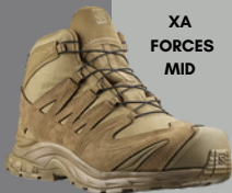
XA FORCES MID