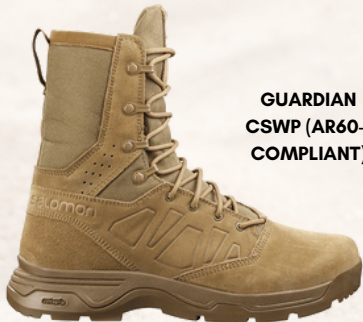
GUARDIAN CSWP (AR60-1 COMPLIANT)