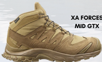
XA FORCES MID GTX