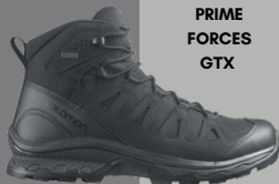
QUEST PRIME FORCES GTX