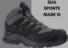
SUA SPONTE MARK III