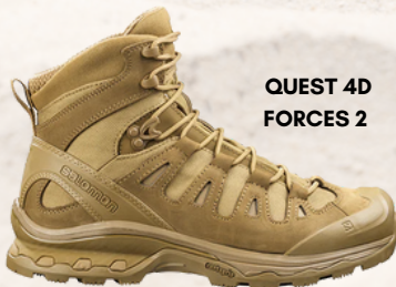
QUEST 4D FORCES 2