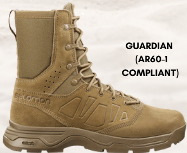
GUARDIAN (AR60-1 COMPLIANT)