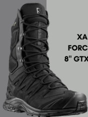
XA FORCES 8" GTX EN