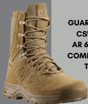
GUARDIAN CSWP AR 670-1 COMPLIAN T