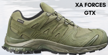
XA FORCES GTX