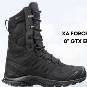
XA FORCES 8" GTX EN