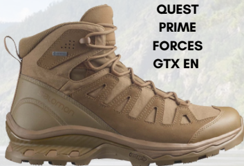
QUEST PRIME FORCES GTX EN