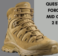
QUEST 4D FORCES MID GTX 2 EN