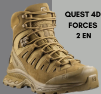
QUEST 4D FORCES 2 EN