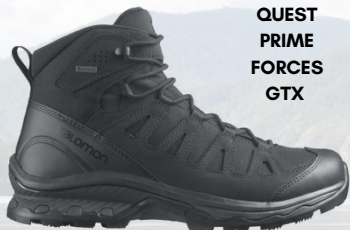
QUEST PRIME FORCES GTX