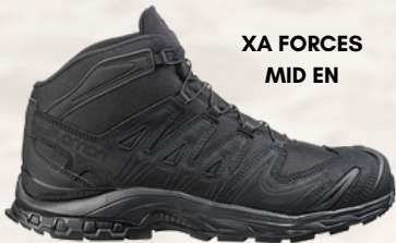
XA FORCES MID EN