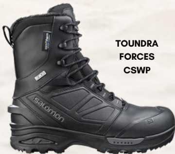
TOUNDR FORCES CSWP