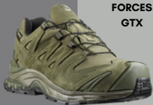
XA FORCES GTX