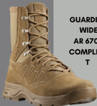
GUARDIAN WIDE AR 670-1 COMPLIAN T