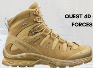
QUEST 4D GTX FORCES 2