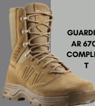
GUARDIAN AR 670-1 COMPLIAN T