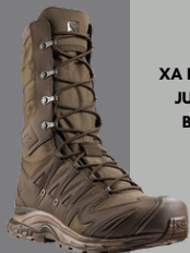
XA FORCES JUNGLE BOOT