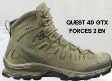
QUEST 4D GTX FORCES 2 EN