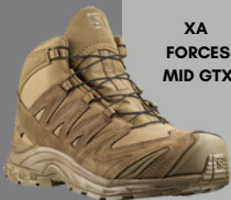
XA FORCES MID GTX