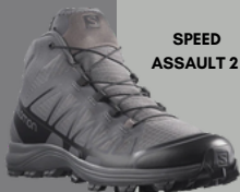
SPEED ASSAULT 2