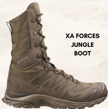
XA FORCES JUNGLE BOOT