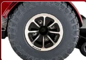
Superb traction, flat-free, drive tires