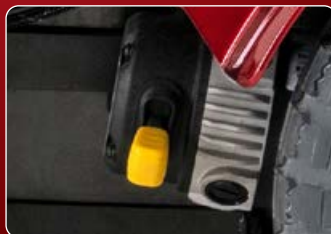
Extremely efficient motor package