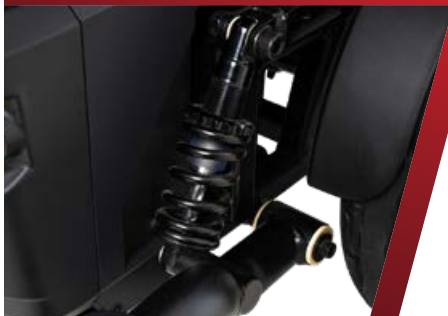
Front and rear independent Active-Trac® ATX Suspension