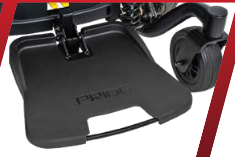
Large footplate with removable rubber cover for easy cleaning