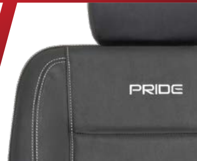
High-back memory foam seat