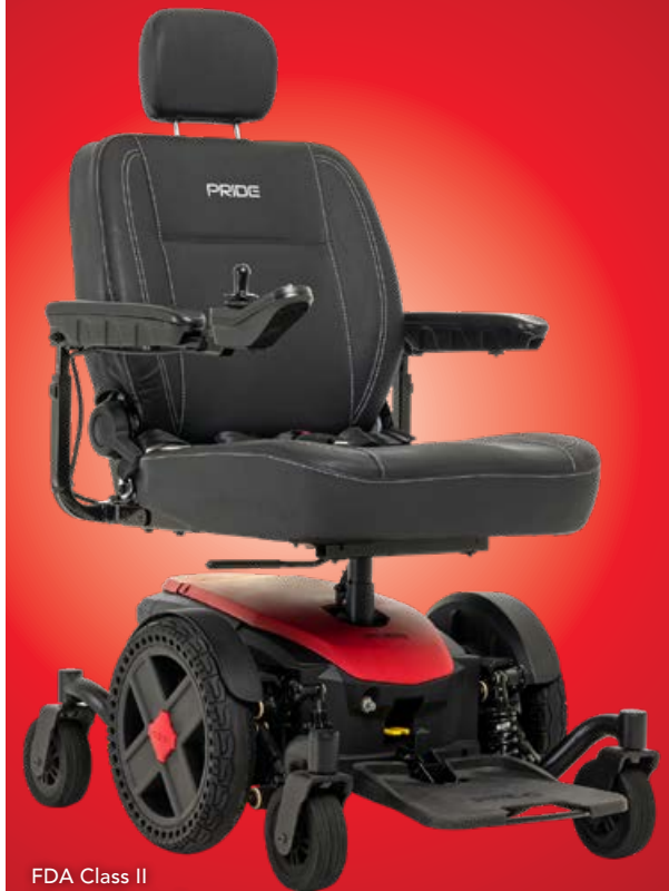
FDA Class II Medical Device 1

OUR MOST ADVANCED HEAVY DUTY POWER CHAIR YET!