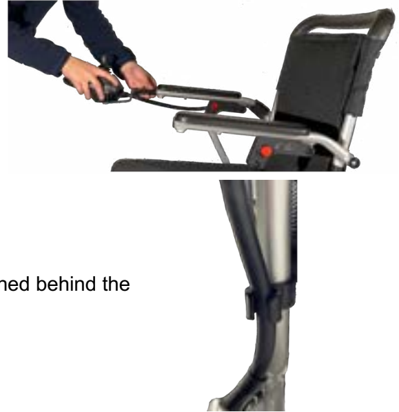
Figure 8. Fit the controller cable into the cable clip fastened behind the armrest to secure the cable.

Figure 7. Slide the controller up the curved end of either arm rest. Secure the controller into place by tightening the controller to the armrest with the armrest screw.