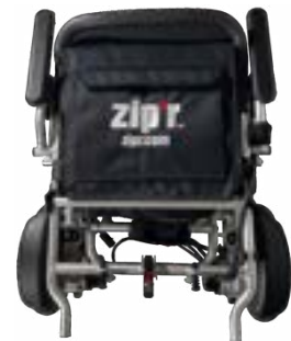
Figure 2. Place one hand on the frame at the front of the seat and your other hand on top of the padded backrest. Pull the two halves of the wheelchair apart while lifting to unfold the wheelchair.

Figure 1. Remove the Zip'r Transport Pro from the packaging placing the wheelchair on the ground with the wheels facing down.