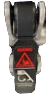
Figure 4. Switch the drive levers located behind each rear wheel from manual mode to drive mode, by pushing forward (one behind each wheel). This will lock your wheelchair into place.

Figure 3. Ensure that the structure of the chair is locked into the open position by pushing the chair lock lever behind the seat into the open position.