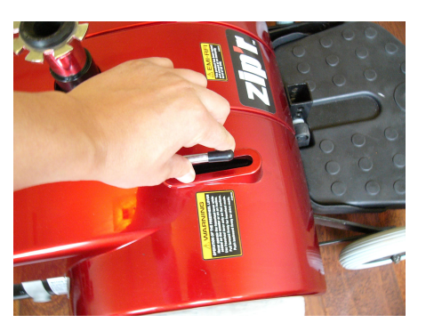
Step 2 Twist the two chrome release levers so that they are pointing forward.