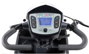
Digital LCD dashboard display