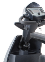
Mecha lock tiller