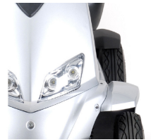
LED lighting system