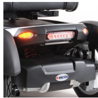
LED lighting system