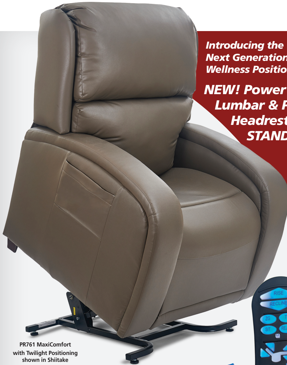
PR761 MaxiComfort with Twilight Positioning shown in Shiitake

Introducing the Next Generation of Wellness Positioning