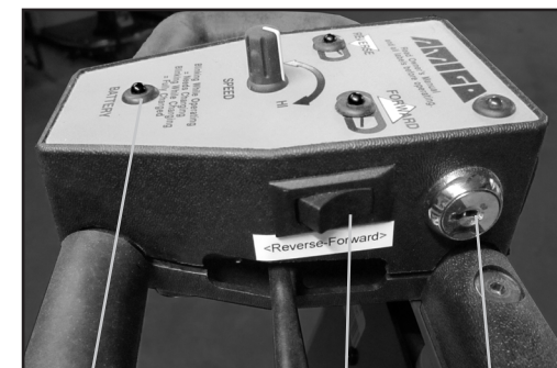
Normal Battery Gauge LED

Warning: While in Shabbat Mode the Amigo will not come to a complete stop when the throttle lever is released to the neutral position. In the event that you must stop the Amigo immediately you will need to depress the Emergency Brake Switch.