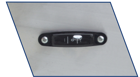
Safety Guide Bubble Level

Safety guide indicates if ramp is on a safe slope!