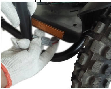
the lower rear frame