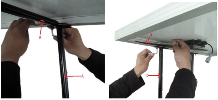
the front frame

7. Fix the solar panel onto the front frames(A) with support pipe(B), fix the solar panel onto the rear frames(C) with support board(D).