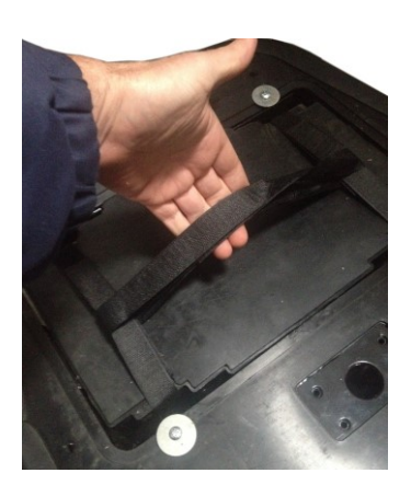
Charging The Batteries Outside Scooter

3. Take out the battery, then charge it.