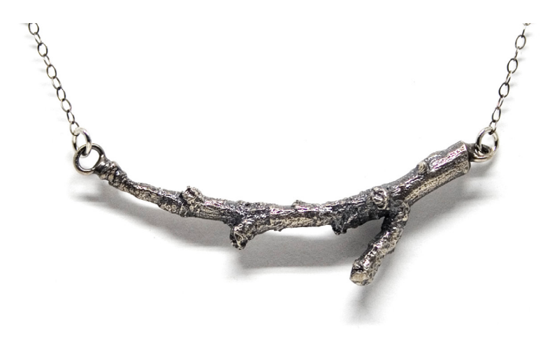
twig necklace To5S $43 To5B $32 To5G $63