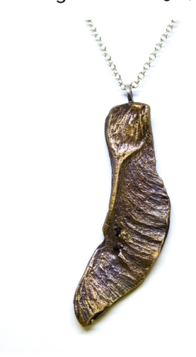
seed necklace: maple wing MogB $33