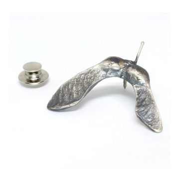
seed pin: medium maple

Mo<sub>9</sub>S sterling silver $43 Mo<sub>9</sub>B bronze $30 Mo<sub>9</sub>G gold vermeil $63