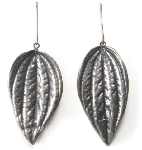
peperomia earrings: large dangle $12$ $55