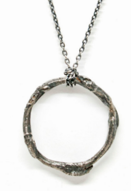
willow necklace Wo1 $36