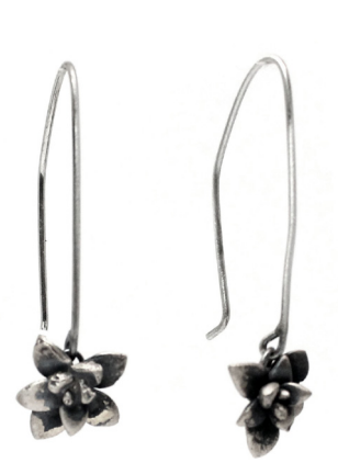
echeveria earrings: drop Eo45 $43