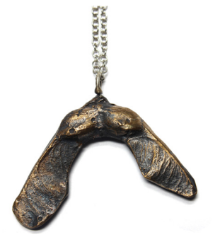
seed necklace: medium maple seed necklace: maple wing