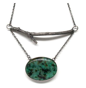
stone necklace: twig statement african turquoise