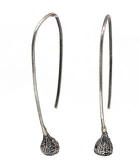
seed earrings: eucalyptus

M10S sterling silver $42 M<sub>10</sub>B bronze $30 gold vermeil $62 M<sub>10</sub>G