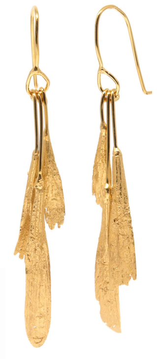
ash seed earrings: bunch Mo2S $43 Mo2B $33 Mo2G $63