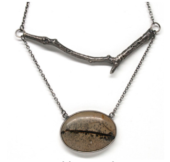
stone necklace: twig statement ST01A artistic stone $96