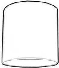
5 GALLON BUCKET

Mounting the Feeder on a t-post has typically less varmint problems than mounting to a tree.