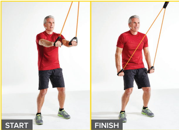
Door Attachment: High Position

Stand with feet hip-width apart, facing door. Grasp handles and straighten arms, positioning hands directly in front of shoulders with palms facing down.