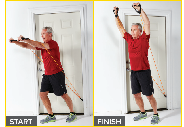
Door Attachment: Low Position

Stand with feet hip-width apart and back to door. Grasp each handle and position hands outside shoulder width, palms facing forward and elbows below shoulders.