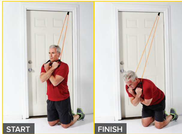
Door Attachment: High Position

Kneel on floor with back to door. Grasp handles, crossing arms in front of chest, and position hands on top of shoulders.