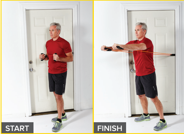
Door Attachment: Mid Position

Stand with feet hip-width apart and back to door. Grasp each handle, palms facing down and position at chest height, with elbows bent just below shoulders.