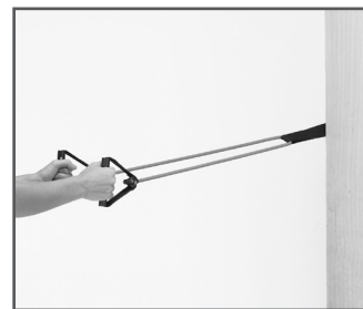
Between top and bottom door hinge