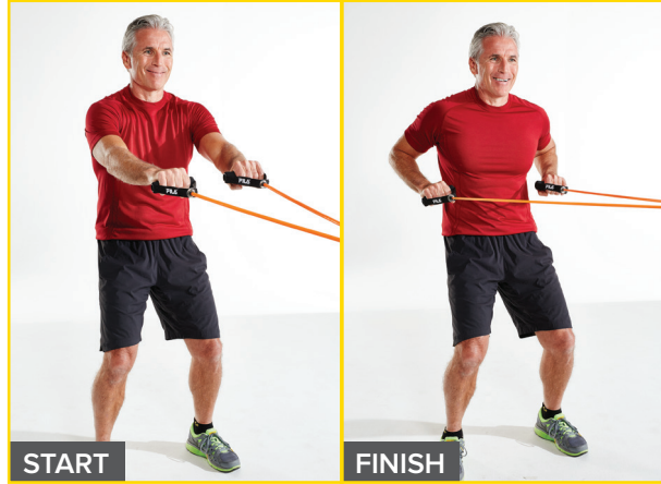
Door Attachment: Mid Position

Stand with feet hip-width apart, facing door. Grasp handles with palms facing down and arms straight out in front of shoulders.