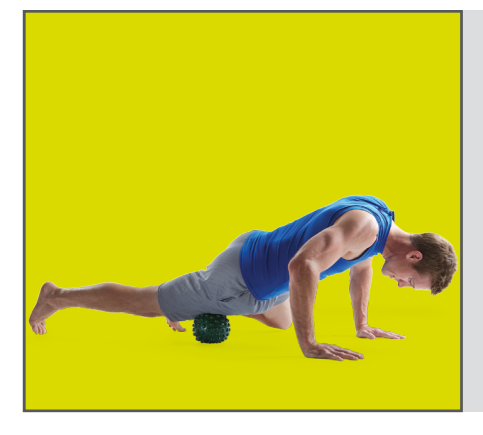
Position ball under front of upper leg, straighten leg with toes on floor. Press hands into floor, and shift body forward and backward while rolling ball along front of upper leg.