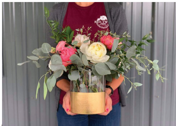
This page, from top: Seasonal peony sales at Red Twig Farms' retail shop; (top) and (second/third) image; (Bottom) Johnny's Selected Seeds