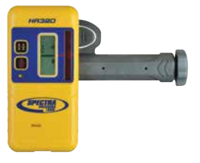
HR320 Receiver and C59 rod clamp included with every package