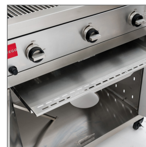
Hidden Residue Tray