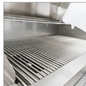
Heavy Duty 8mm Grates