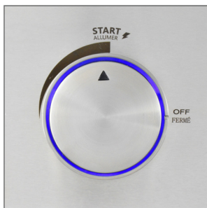
LED Backlit Knobs